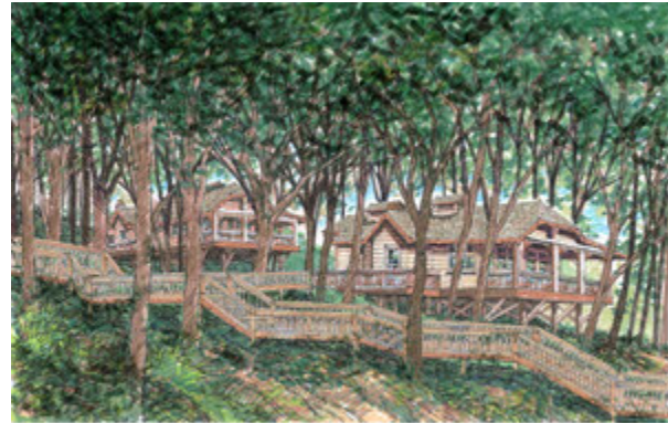
KWANARI ECOLOGE - OCEAN VILLAS

Kwanari is the latest ecolodge in the Caribbean. The site is forested and located at the edge of the Atlantic Ocean. We are introducing a whole new style of architecture called “Forest Caribbean.” Because of the context of the site—rainforest meets ocean—I felt that a new contextual architecture was necessary so that the buildings blend into the forest. It is where the typical bright-colored Caribbean huts meet the “cabin” in the woods. One of the big challenges we have had to deal with is salt spray from the ocean. I have been so particular as regards respect for existing trees that I have now visited the site three times just to ensure that the least amount of trees are cut to build the buildings. The other challenge was the fact that the site is very small and so it was not easy to fit the whole building program into the site.